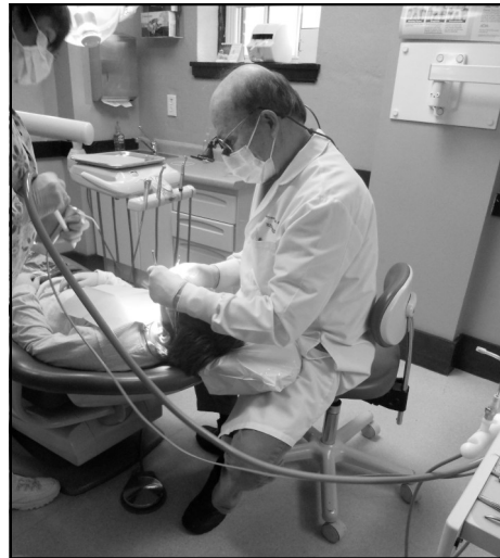
Organizational Grant Recipient: Red Logan Dental Clinic

In 2011, the Foundation funded 1.) Organizational Grants, 2.) Good Neighbor Grants, 3.) Irene related grants, and 4.) Loan Forgiveness Grants. OHF made 28 organizational grants of $861,945 to 20 different agencies addressing health needs in our community. An additional $40,400 in Irene related grants was made.